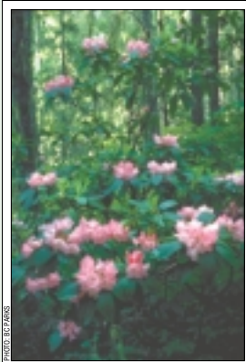
Springtime at Rhododendron Flats