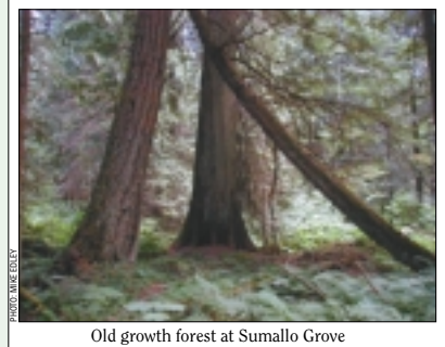
Old growth forest at Sumallo Grove

As the Similkameen River tumbles through the lodgepole pine forest with its wildflowers and wildlife, it offers but one of the flavours of E.C. Manning Provincial Park. Explore the many others!