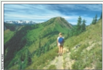
Hiking an alpine trail