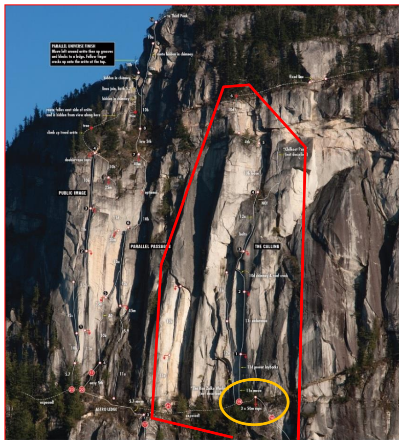
Detailed view of closed routes

Climbing in closed areas could result in fines under Park Act , Park, Conservancy and Recreation Area Regulation 10(2) .