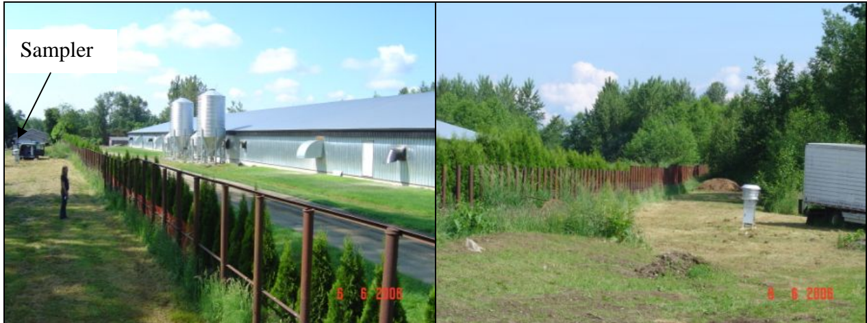
Figure 1 Monitoring location in relation to the poultry barns. (a) View south. (b) View north.

Sampling equipment was sited to obtain representative ambient air samples at the complainant's property. The equipment was situated directly north of the residence and away from the driveway, at a location designed to assess human exposure. While the location of equipment did not meet all criteria for sitting a regional ambient air quality station due to the close proximity of trees and buildings, equipment locations were justified as they were sited to best achieve the objectives of the sampling program.