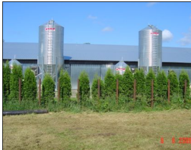
Figure 2 View west towards poultry barn from monitoring location.