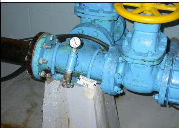
Plate 1. A view of the Bear Lake raw water tap where water samples were collected.

This brief report will summarise water quality data collected from the Community of Bear Lake raw potable water source (ground water) (Plate 1). The data are compared to current provincial drinking water quality guidelines meant to protect finished water if no treatment other than disinfection is present. This comparison should identify parameters with concentrations that represent a risk to human health. It is intended that this program will lead to the identification of human activities responsible for unacceptable source water quality, and that it will assist water managers to develop measures to improve raw water quality where needed.