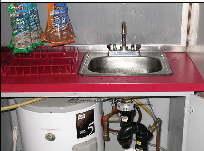
Plate 1. A view of the sampling location for the Fort Fraser raw water supply. This sink is located at the village Petro-Can gas station.