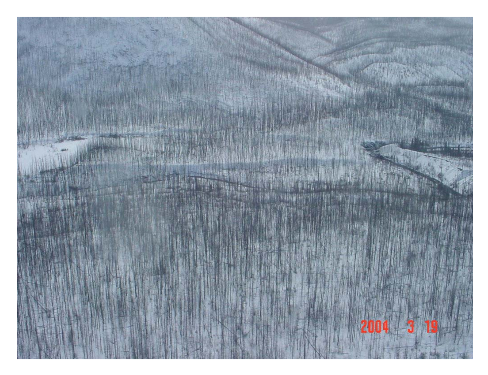
March 19: Chowade River Burn