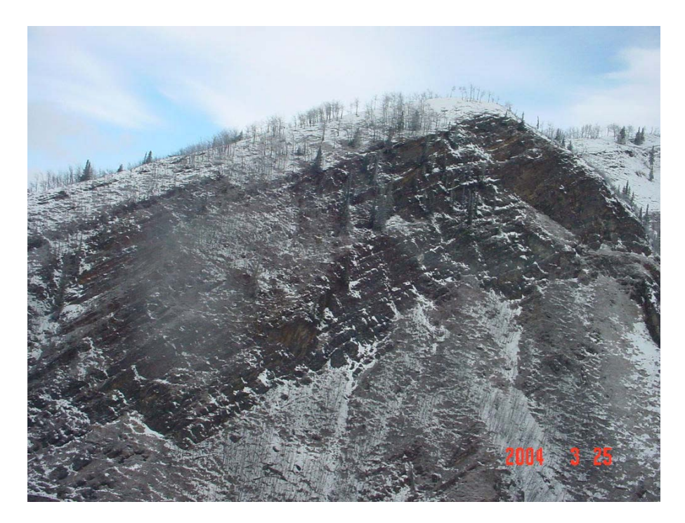
March 25: Gathto Creek (goat/sheep habitat)