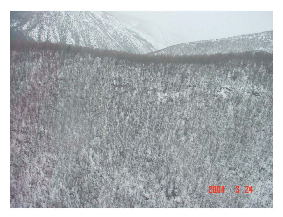
March 24: South slope of Prophet River, requires burning