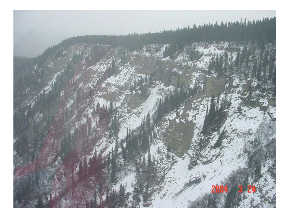
March 24: Sikanni River (south side outside of protected area)