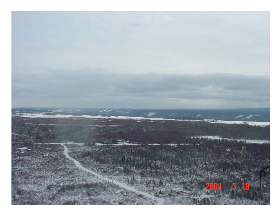
March 19: Hudson's Hope CBM #2 Area, overview near Hudson Hope