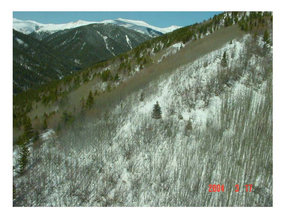
March 17: Belcourt burn area