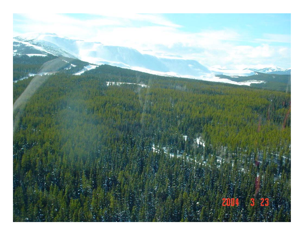
March 23: Wolverine / Bullmoose CBM area