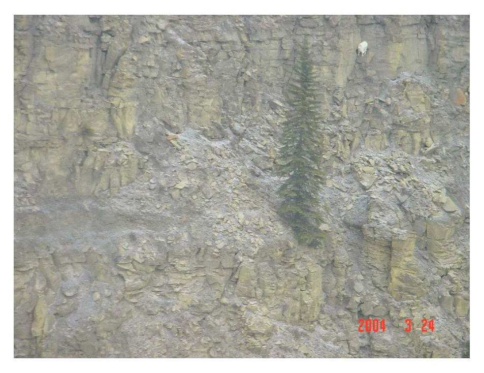
March 24: Sikanni River WHA #5 (note mountain goat in top right of photo)