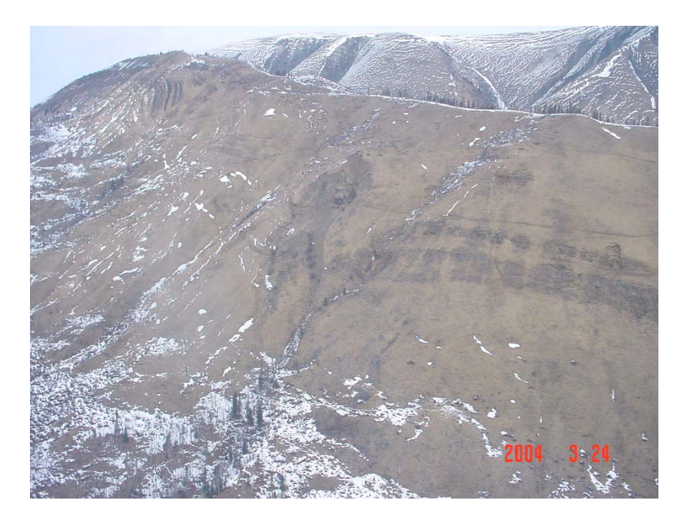
March 24: UWR on Richards Creek