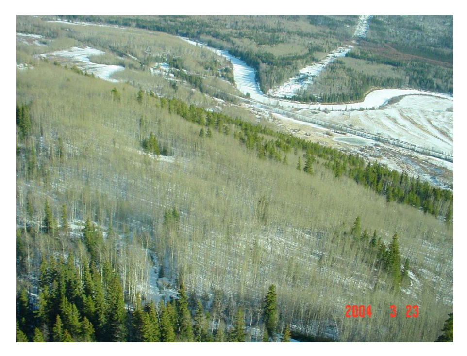
March 23: Potential UWR identified in TSR II (Chetwynd Area)