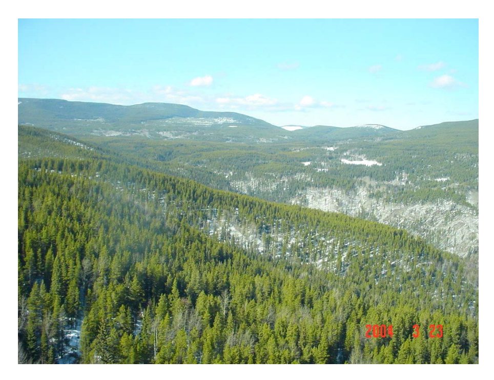
March 23: Sukunka / Highhat CBM area