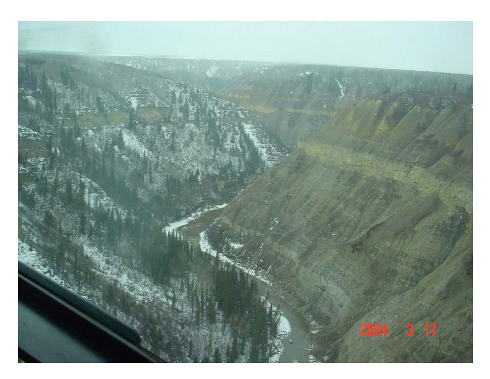
March 17: Kiskatinaw River (view upstream near confluence with Peace River)