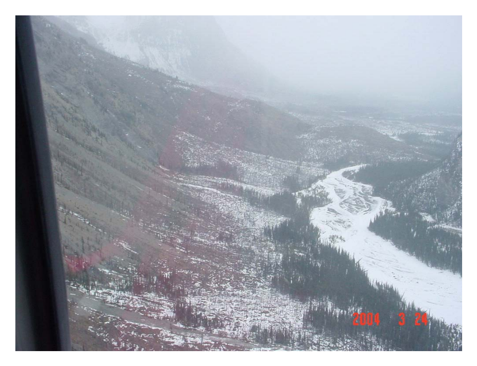
March 24: East end of Prophet River