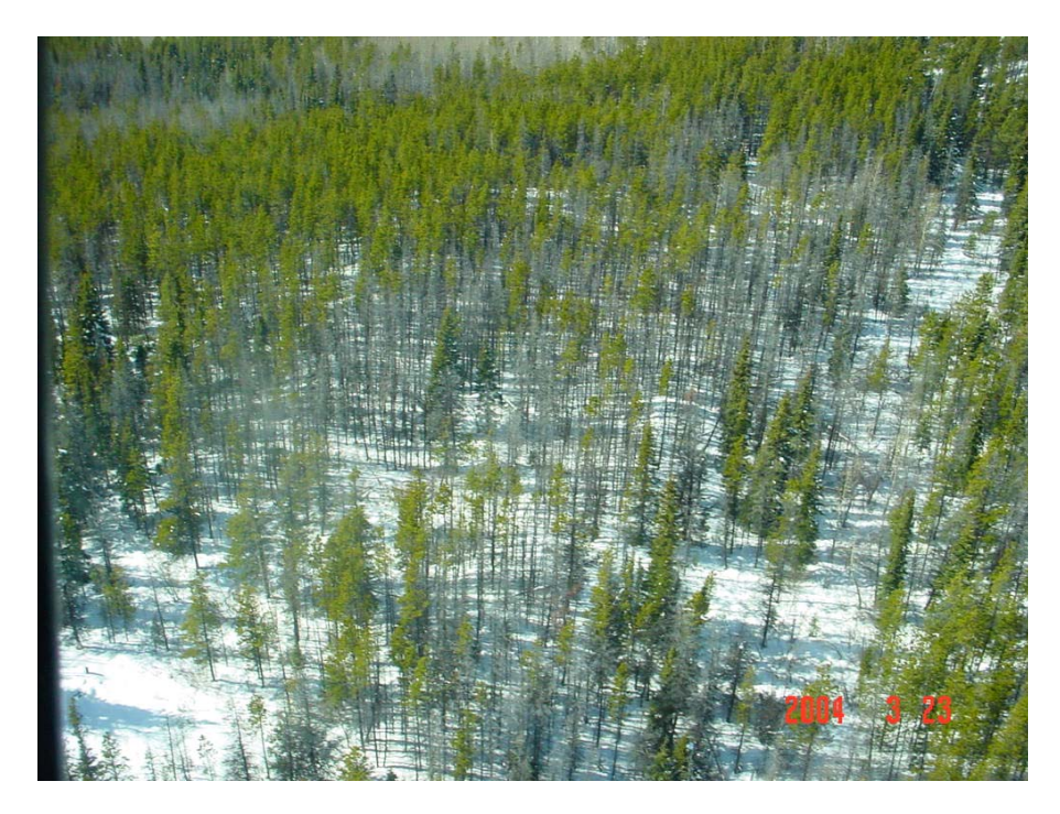
March 23: Wolverine / Bullmoose CBM area