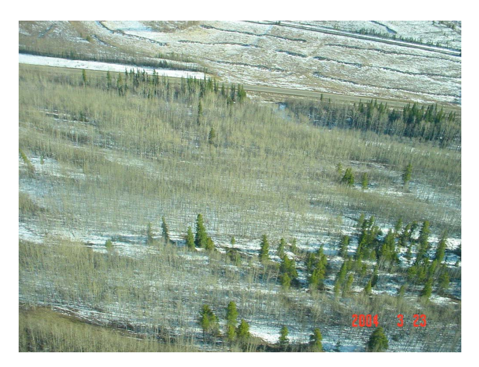
March 23: Potential UWR identified in TSR II (Chetwynd Area)