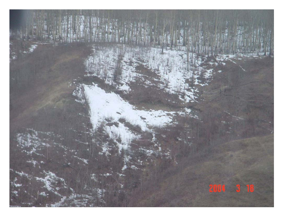
March 18: Pine River (near confluence with Peace River)