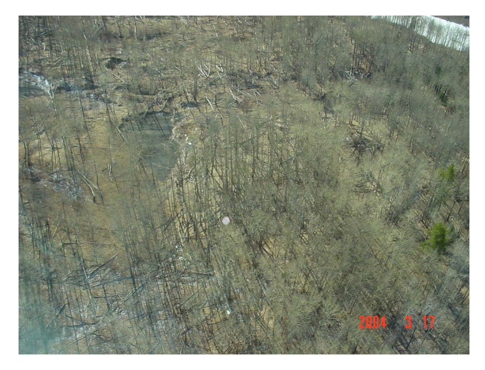
March 17: Old Wives Mountain burn area