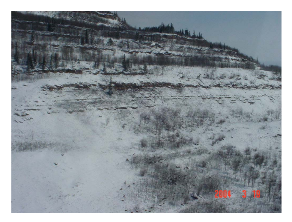
March 19: Dunlevy UWR