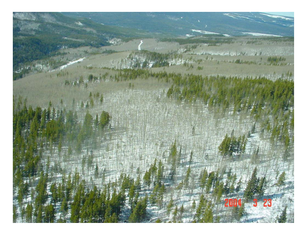
March 23: Wolverine / Bullmoose CBM area