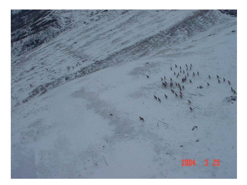
March 25: Gathto Creek (note elk)