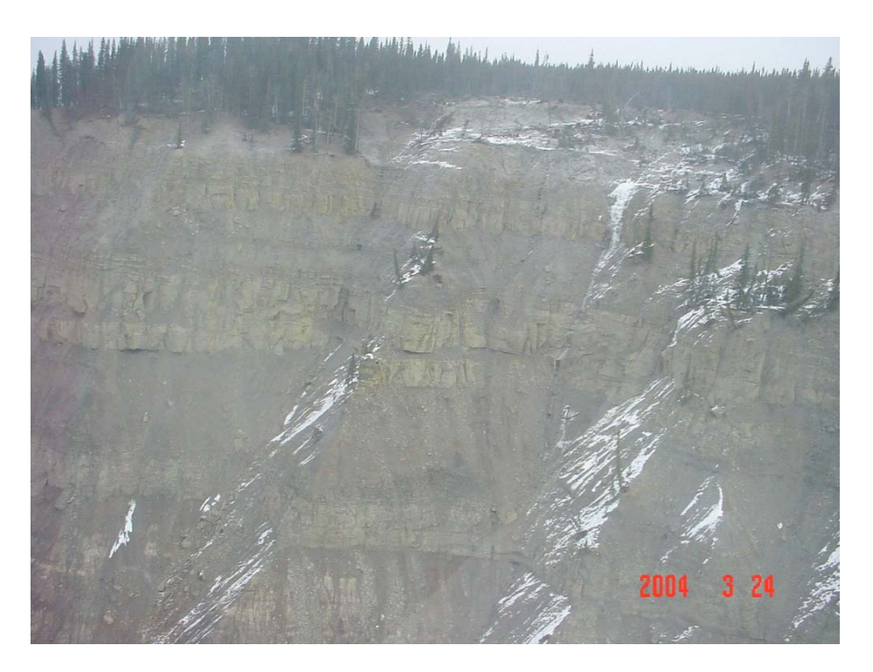
March 24: Sikanni River (south side in protected area)