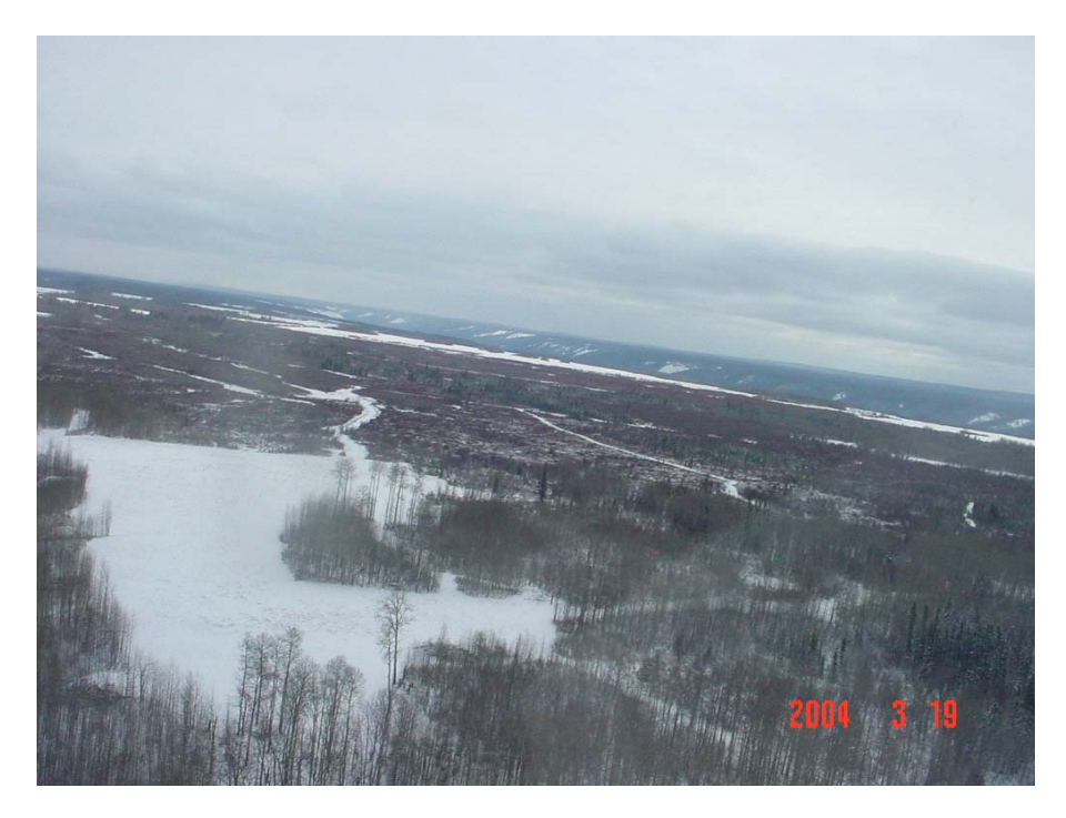
March 19: Hudson's Hope CBM #2 Area, overview near Hudson's Hope