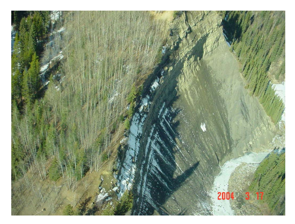
March 17: Mountain Goat WHA #1