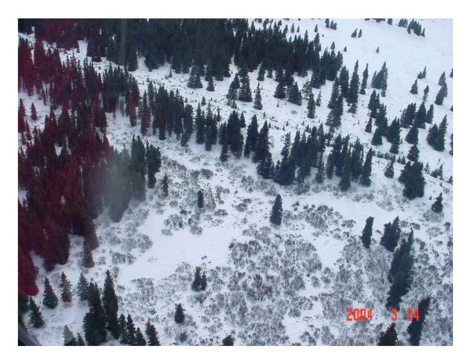
March 24: moose browse in Nevis Valley