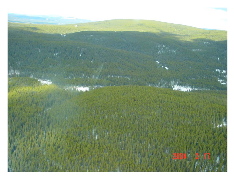
March 17: Wapiti / Red Deer CBM area (near Wapiti River)