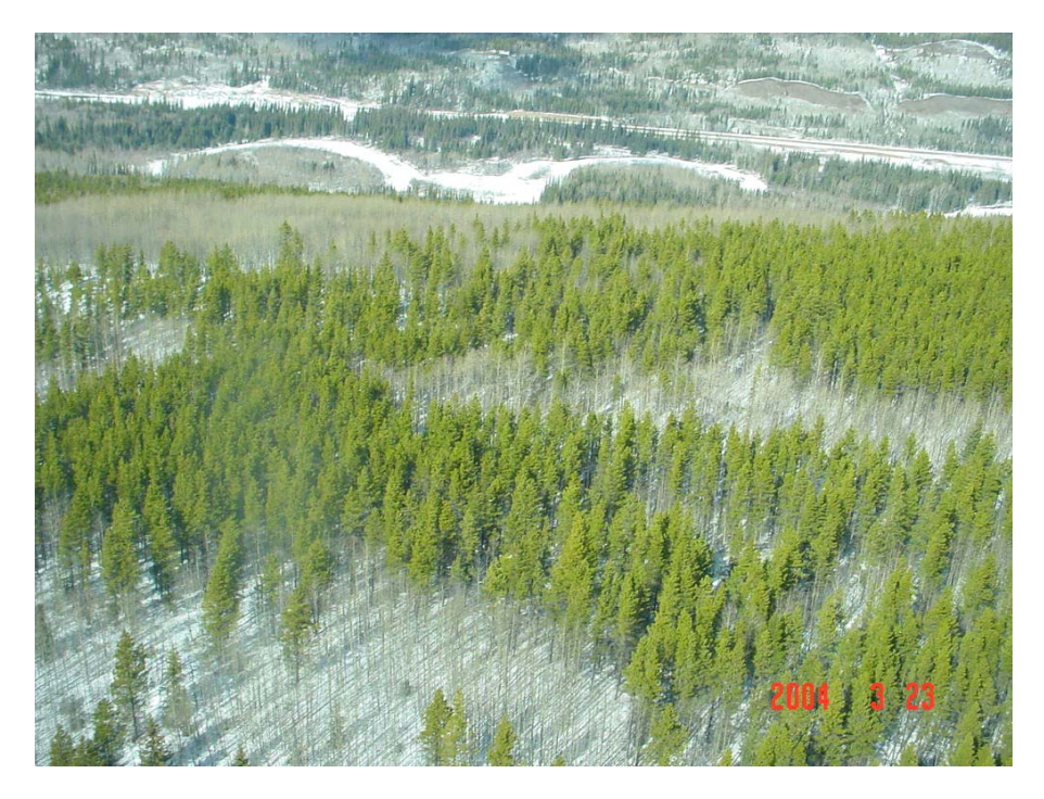
March 23: Wolverine / Bullmoose CBM area