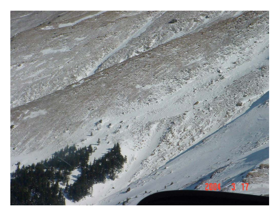
March 17: south face of Dinosaur Ridge