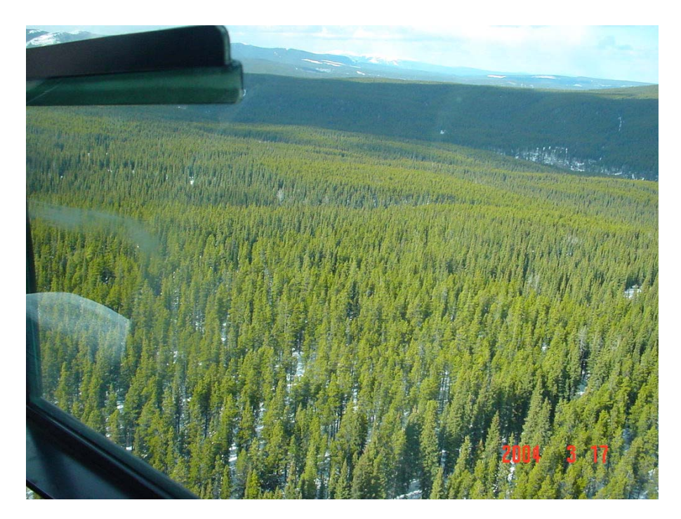
March 17: Wapiti / Red Deer CBM area (near Wapiti River)