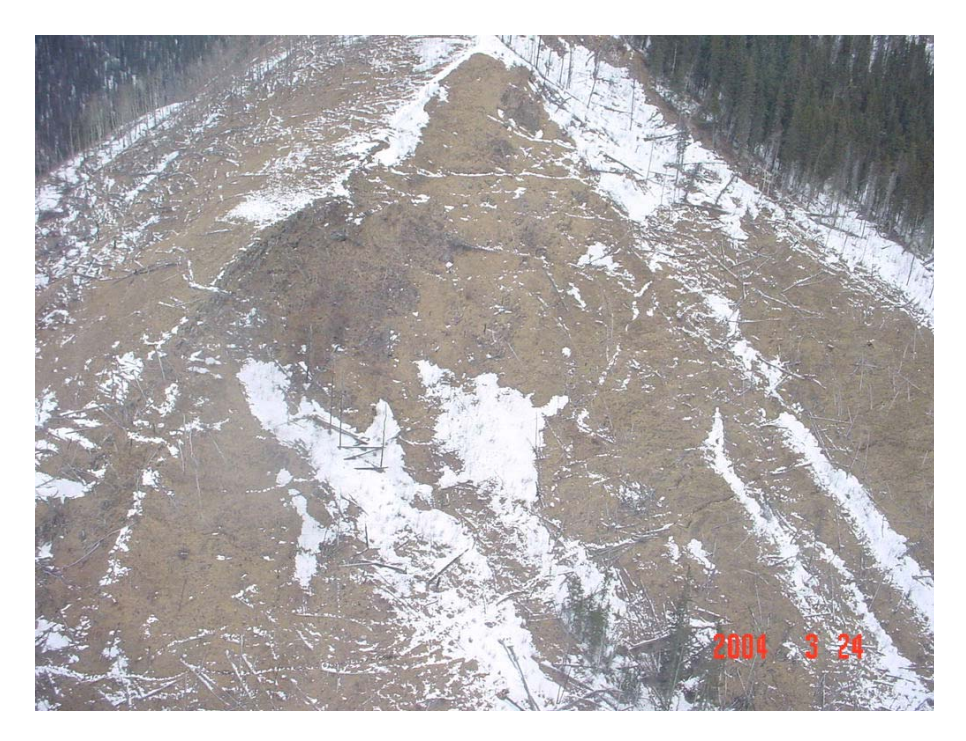
March 24: UWR on the Besa River