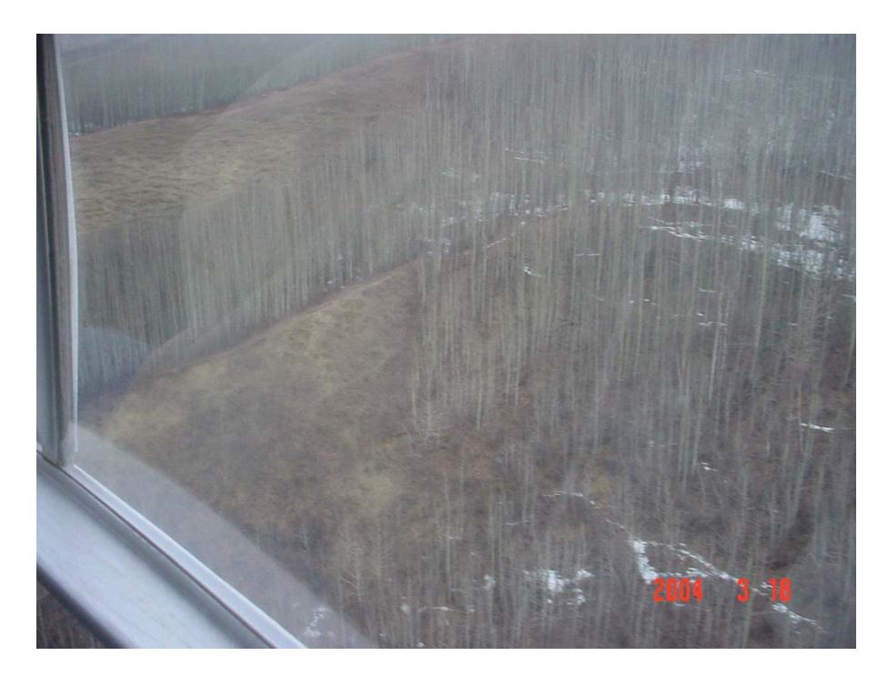
March 18: Pine River (near confluence with Peace River)