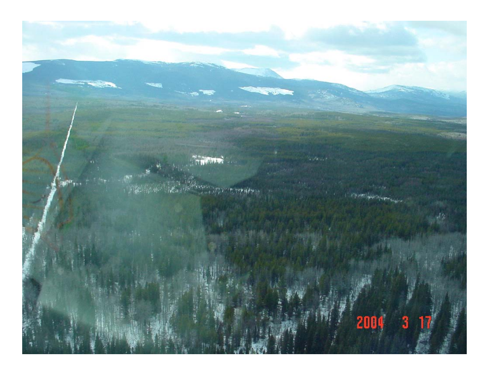
March 17: Wapiti / Red Deer CBM area