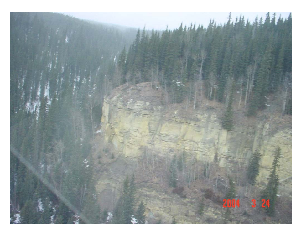
March 24: Sikanni River WHA #1