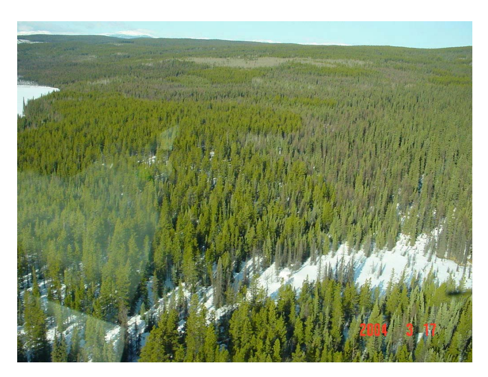
March 17: Caribou area of interest (south of Bearhole)