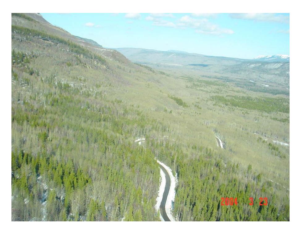
March 23: Sukunka / Highhat CBM area