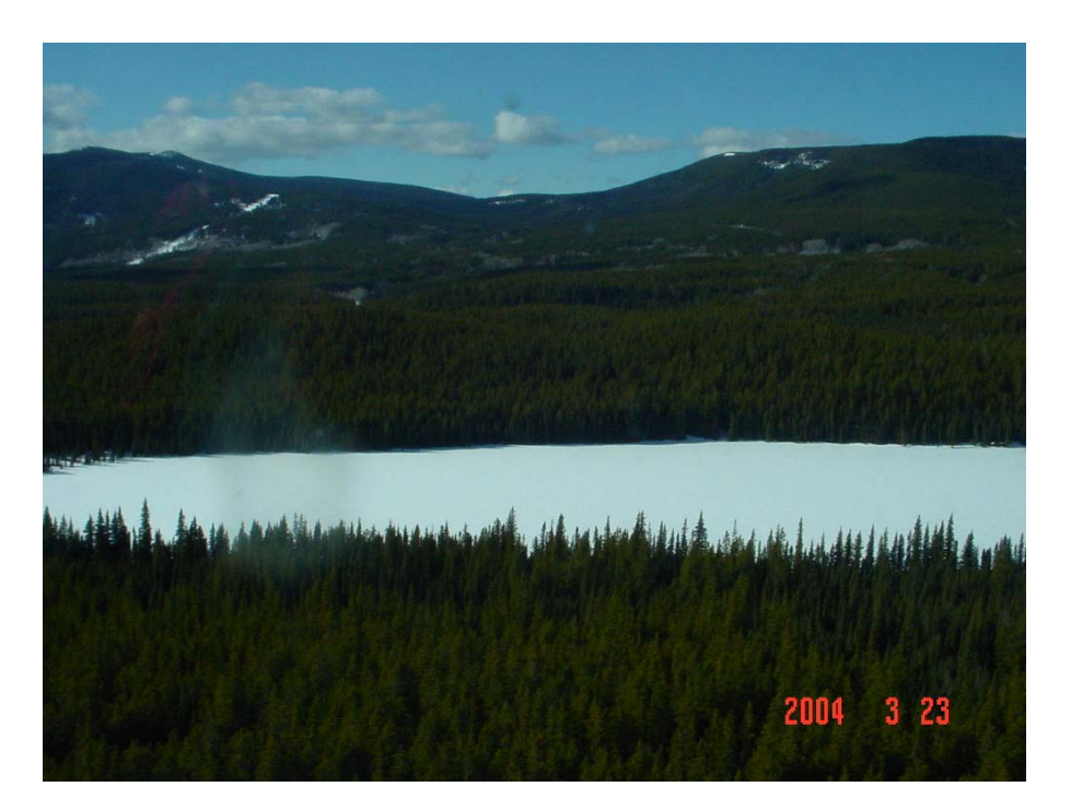
March 23: Sukunka / Highhat CBM area