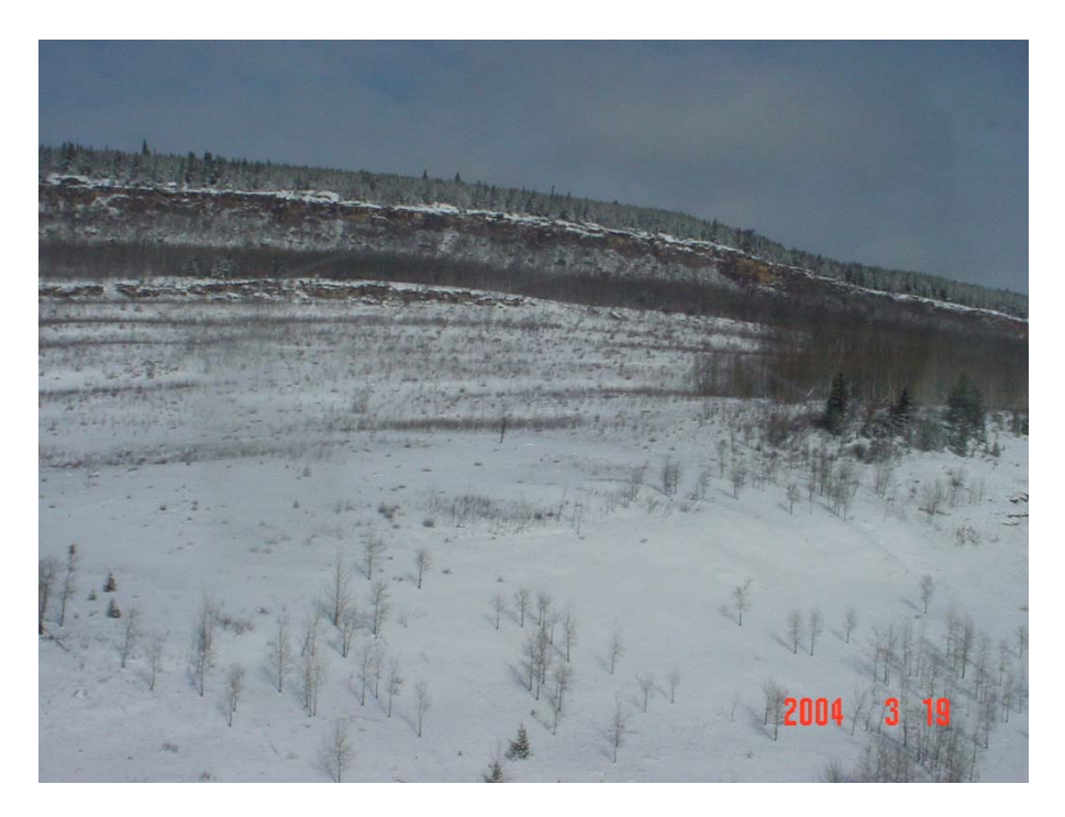
March 19: Dunlevy UWR