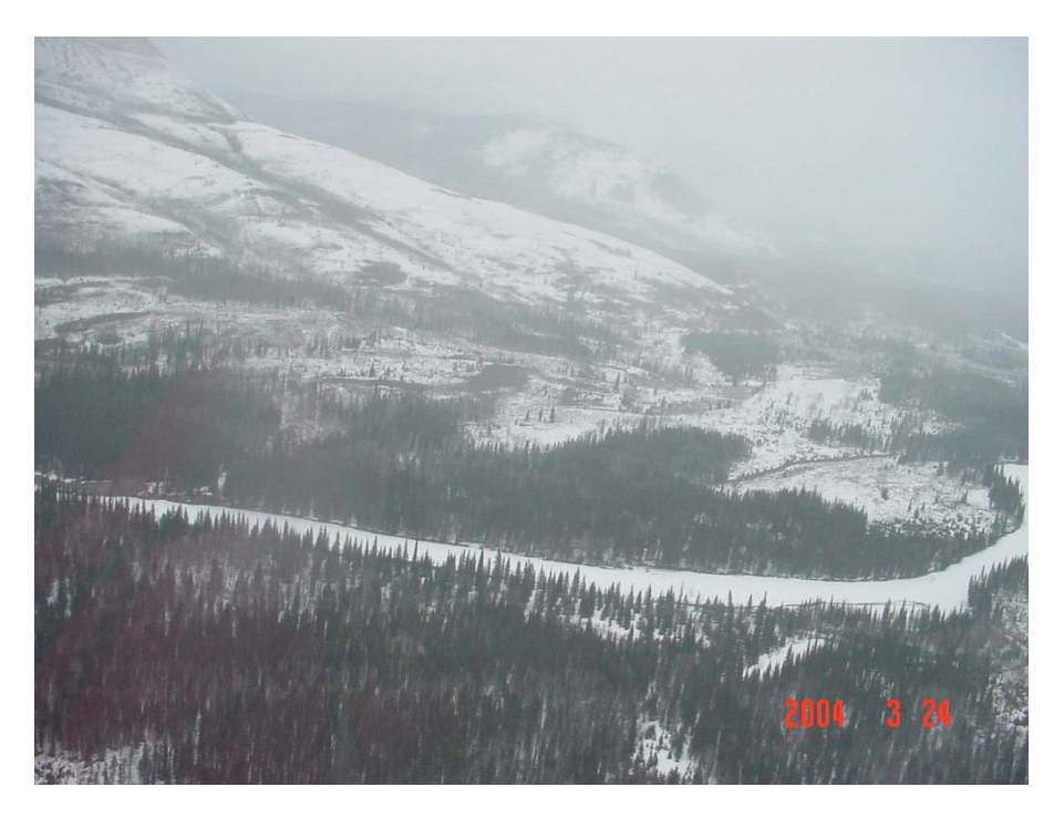
March 24: Muskwa River and south facing slope