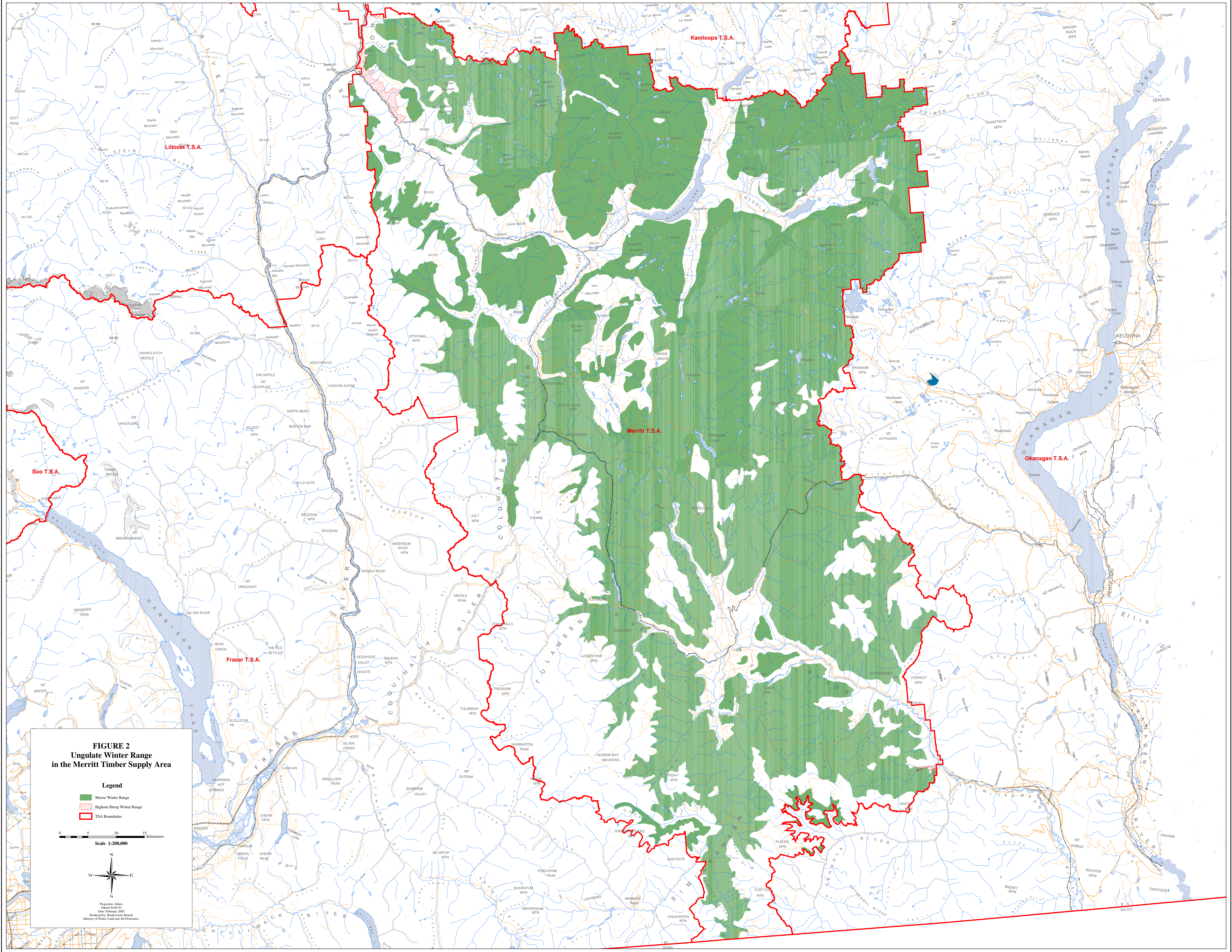
FIGURE 2 Ungulate Winter Range in the Merritt Timber Supply Area