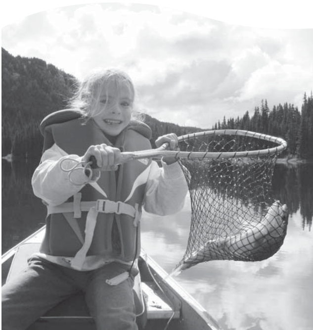
Families love to share the adventure of catching fish!