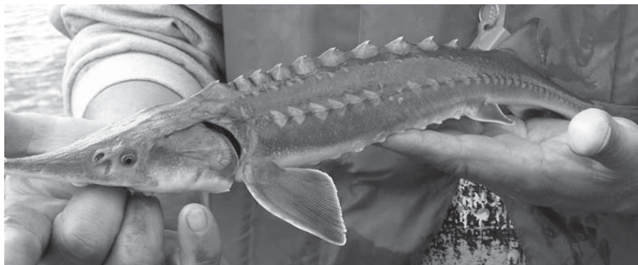
Conservation-cultured juvenile sturgeon recaptured at age two.

www.nechakowhitesturgeon.org or www.env.gov.bc.ca/omineca/esd/faw/sturgeon