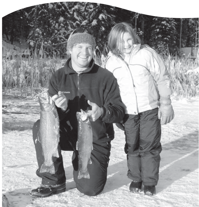
Ice fishing is a great way for families to spend time together.