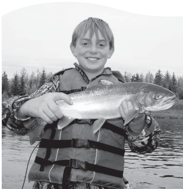
Rivers produce great family fishing too!