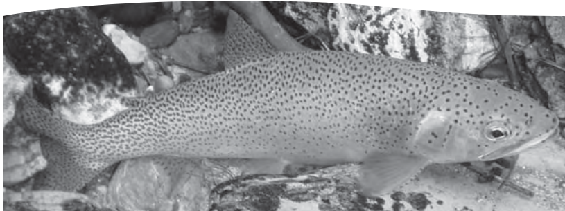
Westslope Cutthroat - a popular sport fish in the East Kootenays Kelly Latch

This plan has two main objectives: (1) conservation of population diversity, and (2) maintenance of quality recreational opportunities consistent with conservation. This plan will assess the key threats and limiting factors for Westslope Cutthroat Trout, and will identify means of mitigating them and ensuring angling opportunities are maintained throughout the species' range.