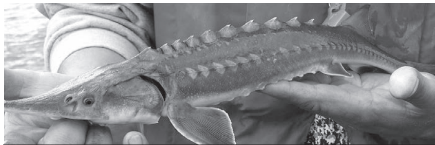
Conservation-cultured juvenile sturgeon recaptured at age two.

Help from the public will also be necessary for recovery and the Nechako White Sturgeon Recovery Initiative requests that you report date and location of all sightings or incidental captures, particularly in the Upper Nechako, Fraser Lake and Stuart/Takla Watersheds. If you observe or accidentally catch a sturgeon please call the Ministry of Forests, Lands and Natural Resource Operations at 250-565-6135, or go to either of these web sites: www.nechakowhitesturgeon.org or www.env.gov.bc.ca/omineca/esd/faw/sturgeon