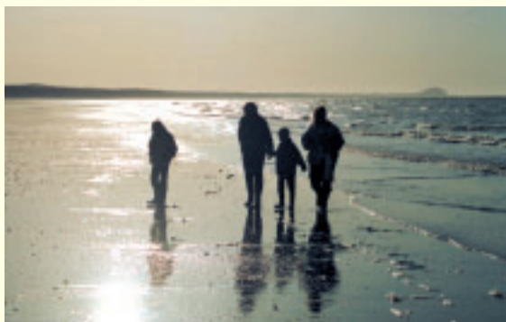
North Beach, Naikoon Provincial Park