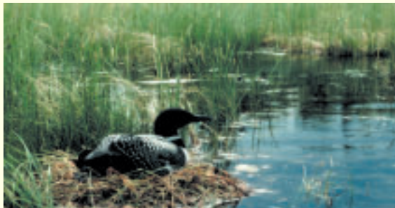
Common Loon, Tyhee Lake (D.K. Harris)