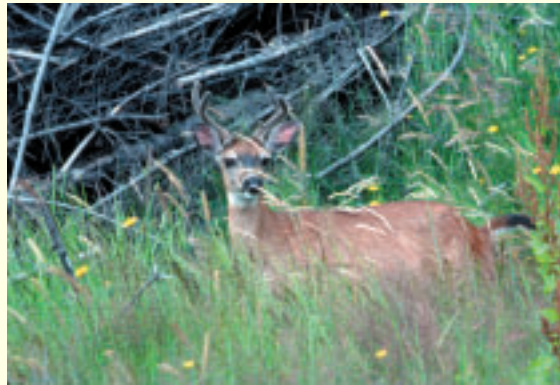
Sitka Deer, Queen Charlotte Islands (D. Horwood)