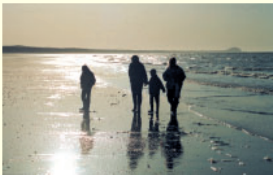
North Beach, Naikoon Provincial Park