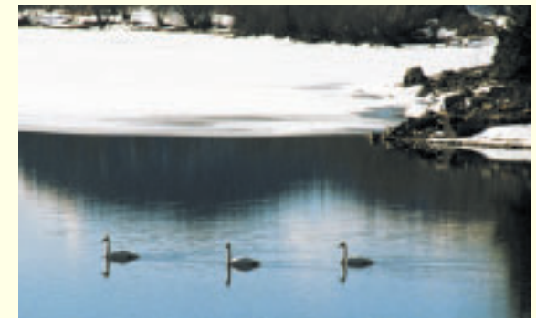
Trumpeter Swans, Francois Lake