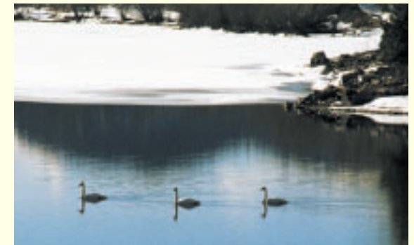
Trumpeter Swans, Francois Lake