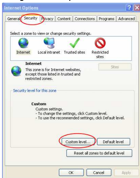
Fig1. Internet Options Panel