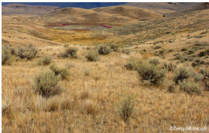
Figure 2 Shrub-steppe grassland habitat near Kamloops, B.C.