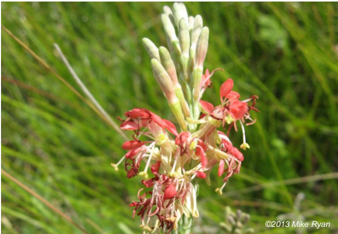
Figure 5 Plant showing terminal clusters of 4-petaled, pink flowers