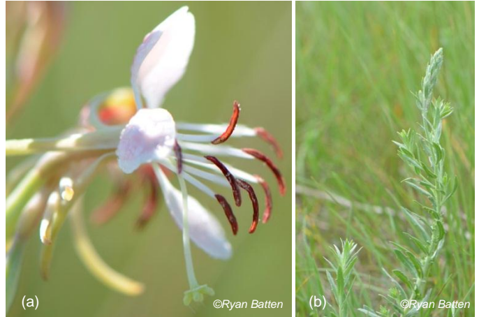
Figure 6 Close-up of (a) flower showing spoon-shaped petals, extended stamens and lobed stigma, and (b) simple, arching stem