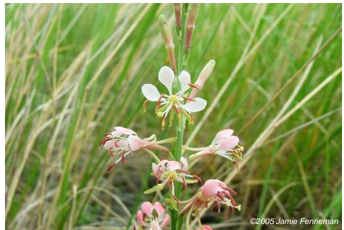
Figure 3 Flowering plant in grassy trailside habitat near Medicine Hat, Alberta