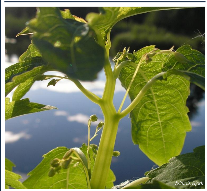
Figure 4 Close-up of Impatiens aurella showing self-pollinating, non-opening cleistogamous flowers in full bloom