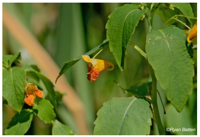
Figure 3 Close-up of Impatiens aurella from near Vernon, B.C., showing its characteristic abruptly tapered spur and spotted petals