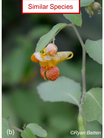
Figure 5 Other than the difference in flower size and angle, both (a) Impatiens aurella and (b) Impatiens capensis look remarkably similar and occupy the same habitats