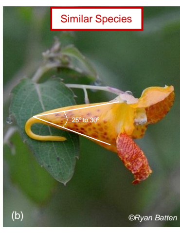
Figure 6 Comparison of relative flower size between (a) Impatiens aurella , which has a more abrupt taper in the spur, and (b) Impatiens capensis (scale equal)