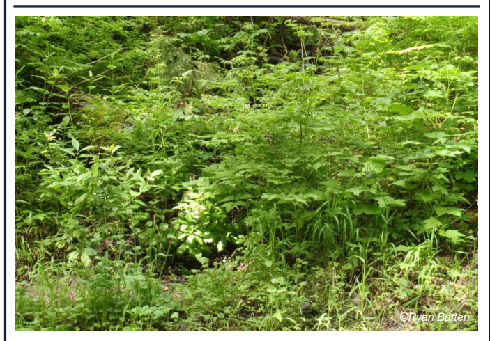
Figure 2 Typical densely vegetated habitat at edge of wetland