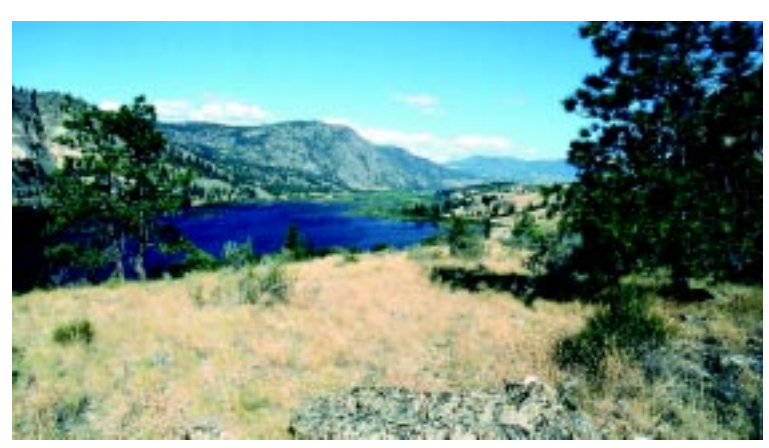
OPEN GRASSY AREAS WITH DEEP SOILS ARE PREFERRED BADGER HABITAT.