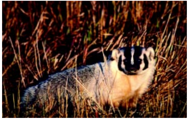
The badger has distinctive black and white facial markings.

ments and by staying in burrows for long periods to reduce heat loss. During cold spells, Badgers may enter a state of