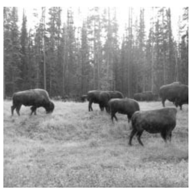
BISON ARE GRAZERS AND IN BOREAL AREAS, GRASSES AND GRASS-LIKE PLANTS COMPRISE OVER 85% OF THE WOOD BISON DIET FOR ALL SEASONS. P. Goetz

Northeast British Columbia contains a significant area of former Wood Bison range. Re-establishing at least one herd of 400 or more pure Wood Bison in that part of the province would be a major success story in Canadian conservation. Returning this unique animal to its native haunts in BC will depend on public support for efforts to recover Bison habitat.