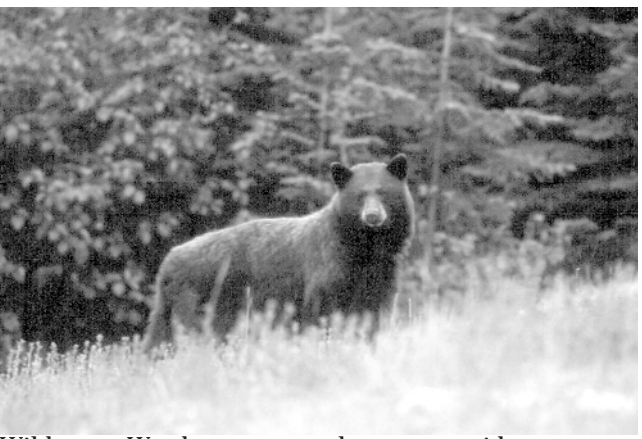
Wilderness Watch program, volunteers provide extra "eyes and ears" for the Conservation Officer Service.

Because of international concern for the conservation of all species of bears, the black bear is listed on Appendix II of the Convention on the International Trade of Endangered Species (CITES). In February 1993, British Columbia introduced legislation banning the possession and commercial trading of bear gall bladders and genitalia and the trading, exporting, and importing of bear paws, primarily to discourage the incidence of poaching to provide animal parts for traditional Asian medicines. Observe, Record, and Report is a program with toll-free access (1-800-663-WILD [9453]) for anyone to report poaching or other violations of wildlife and environmental laws. Through the B.C. Wildlife Federation's