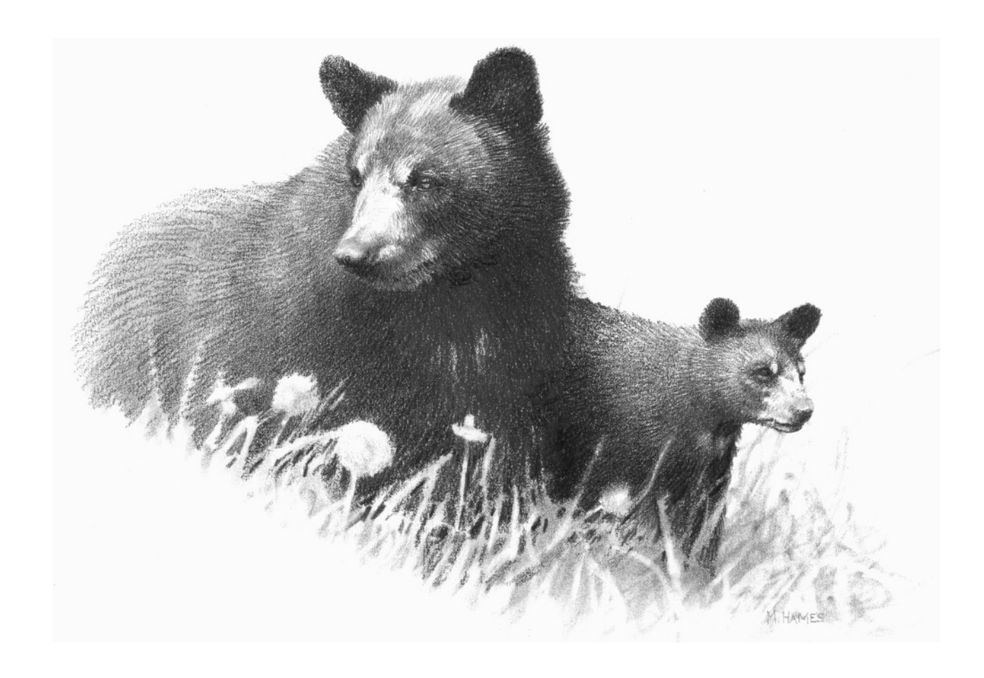
Ecology, Conservation and Management