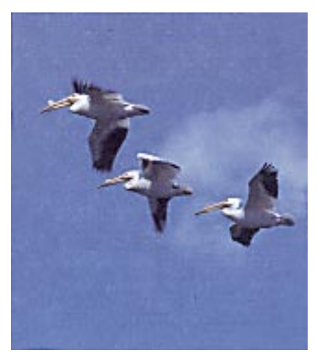
WHITE PELICANS ARE GRACEFUL IN FLIGHT.

BC Environment and BC Parks staff. with the assistance of naturalists, conduct annual counts, make periodic patrols to control disturbance of nesting pelicans by recreationists, and encourage people wishing to see or photograph pelicans to visit pelican foraging lakes rather than Stum Lake. Pilots have been