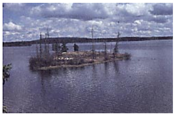
SMALL ISLANDS IN STUM LAKE ARE USED FOR NESTING.