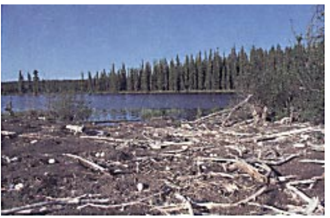
NESTS ARE OFTEN BUILT ON BARE GROUND

advised not to fly lower than 600 m over the colony from May to August. Fishing, trapping, hunting and dis-