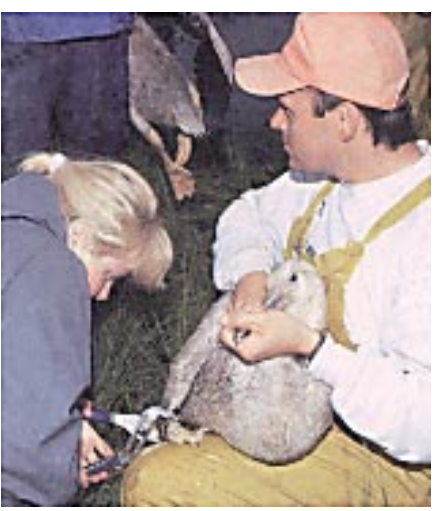
YOUNG PELICANS ARE BANDED EACH YEAR.

support programs that will ensure they are always part of our precious wildlife heritage.