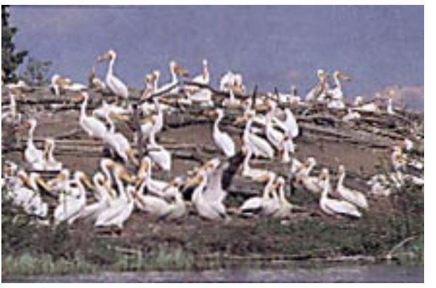
PELICANS NEST IN CLOSE PROXIMITY TO ONE ANOTHER.

The autumn migration out of British Columbia seems generally to follow the spring route, but is more leisurely, and the flocks are smaller (usually less than