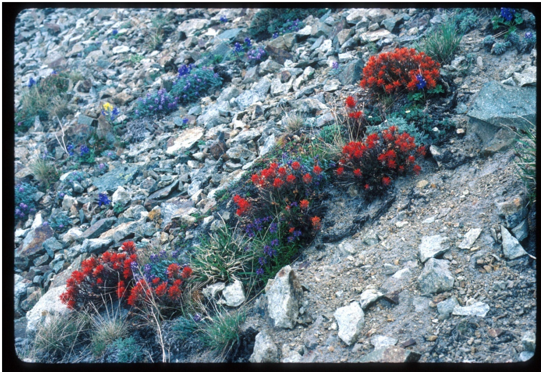
Figure 4. Alpine habitat of cliff paintbrush.

There does not appear to be a lack of suitable habitat for the plant within its range in British Columbia, although microhabitat preferences have not been determined.