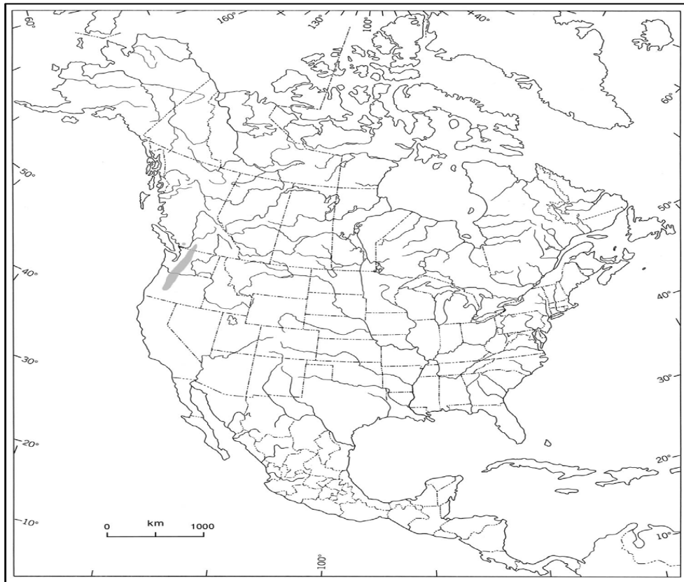
Figure 2. North American and global range of cliff paintbrush highlighted in grey.

In Oregon, cliff paintbrush is more prevalent than was previously believed, there is a low level of threat, and populations appear to be stable (Vrilakas, pers. comm., 2007). The species is now considered to be of conservation concern but not currently threatened or endangered. NatureServe ranks this species in Oregon as S3 (vulnerable to extirpation or extinction; NatureServe 2008).