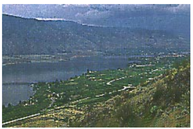
MUCH OF THE ORIGINAL SAGEBRUSH HABITAT IN THE SOUTH OKANAGAN HAS BEEN DEVELOPED FOR HOUSING AND AGRICULTURE.