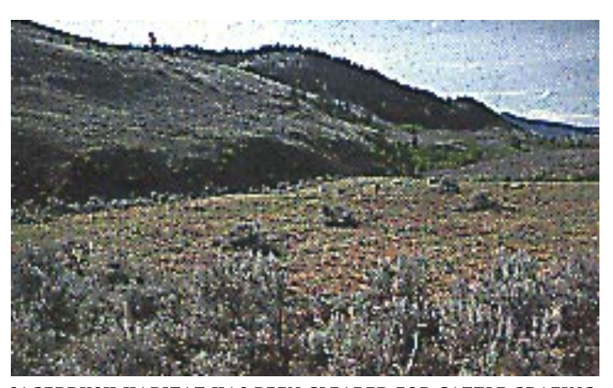
\begin{tabular}{ll} \textbf{SAGEBRUSH HABITAT HAS BEEN CLEARED FOR CATTLE GRAZING.} \\ \textbf{\it Bill Harper photo} \end{tabular}