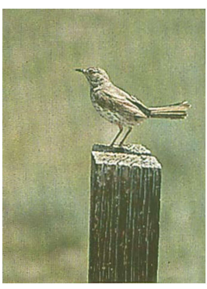
AN ADULT SAGE THRASHER

cies and habitats led to formation of the South Okanagan Conservation Strategy (SOCS) by the Nature Trust of British Columbia, BC Environment (Wildlife Branch), and other cooperating groups.