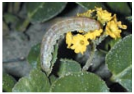
SAND-VERBENA MOTH LARVAE FEED-ING ON RARE YELLOW SAND-VERBENA.

If you are a private land owner with dunes on your property, avoid activities that will damage dune vegetation or impede the flow of sand. In particular, locate roads and buildings outside the dune zone to avoid creating a situation where artificial stabilization of the sand is required to protect your property, and remove existing artificial barriers to sand flow.