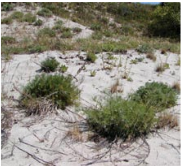
SAND-BINDING NORTHERN WORMWOOD AND NATIVE RED FESCUE DOMINATE A RARE DUNE ECOSYSTEM ON SAVARY ISLAND.

he relatively few gentle coastline areas explain the natural rarity of coastal sand dune ecosystems. We do not know the exact area of