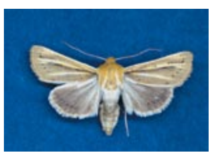
SAND-VERBENA MOTH