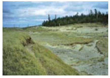
SAND NECK DUNES AT CAPE SCOTT PROVINCIAL PARK.