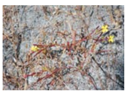
DIMINUTIVE CONTORTED EVENING PRIMROSE ON SAVARY ISLAND.