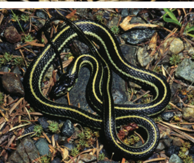
Common Garter Snake