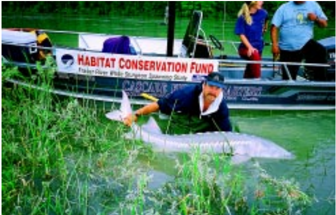
THIS STURGEON SHOWS THE HETEROCERCAL TAIL SHAPE AND SCUTES CHARACTERISTIC OF THE SPECIES. CHANNEL