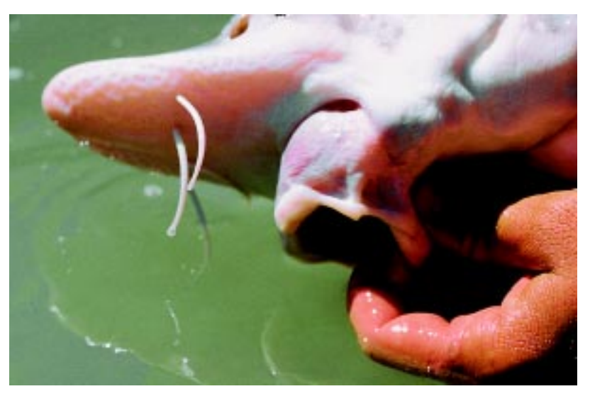
THE BARBELS AND PROTRUSIBLE MOUTH EQUIP THE STURGEON FOR FEEDING IN MURKY WATER.

Large sturgeon there also consume invertebrates, particularly crayfish, but the bulk of their diet is made up of fish. In May, spawning eulachons are devoured in great quantities, while spawning salmon are important in summer and fall. Some of these fish are probably spawned-out carcasses scavenged from the bottom. Sculpins, stickleback, lamprey and small sturgeon have also been found in sturgeon stomachs.