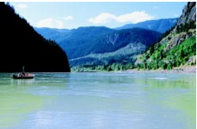
ADULT STURGEON SPEND MOST OF THEIR TIME IN MAIN RIVER CHANNELS.