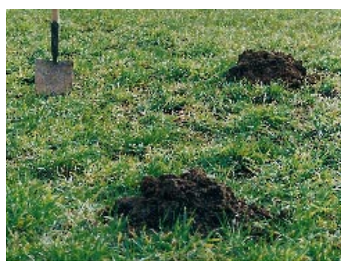
TYPICAL LARGE MOUNDS PRODUCED BY TOWNSEND'S MOLES.

surface and Townsend's Mole tunnels may extend to depths of three metres.