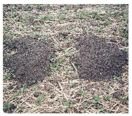
POCKET GOPHERS PRODUCE SMALL FAN-SHAPED MOUNDS.