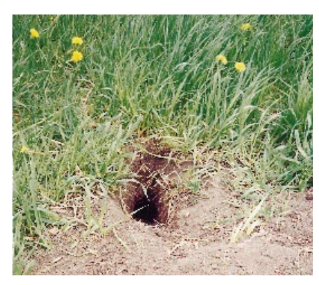
GROUND SQUIRRELS DO NOT PRODUCE MOUNDS WHEN BURROWING.

With your support and tolerance, this unique mammal will continue to "dig" British Columbia.