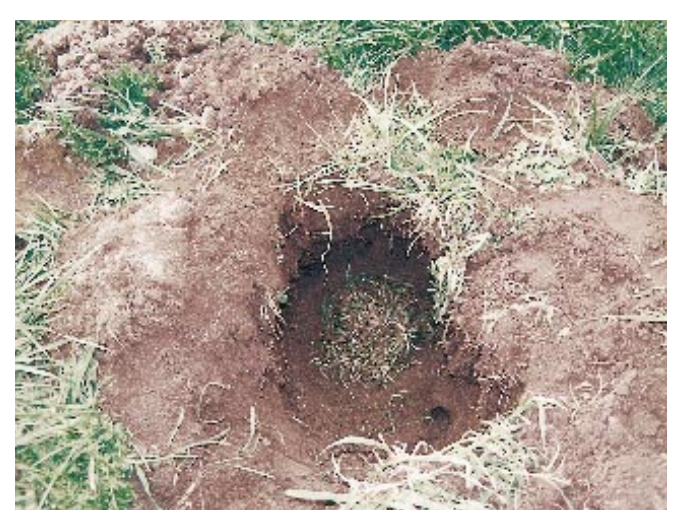
TOWNSEND'S MOLES LINE THEIR NESTS WITH GRASS.