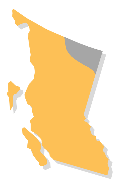
Present range of the Western Toad in British Columbia

CONSERVATION CONCERN ARE SPECIES THAT ARE APPARENTLY SECURE BUT THAT HAVE EITHER A RESTRICTED DISTRIBUTION, OR PERCEIVED FUTURE THREATS, OR THAT ARE ASSOCIATED WITH A HABITAT ELEMENT THAT IS RARE OR BECOMING RARE.