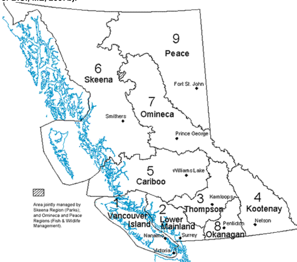
Figure 2: British Columbia Ministry of Environment's Management Regions (Government of B.C., ME, 2007b).

The 7 captive elk herds identified in the 2001 Census of Agriculture held a total of 341 animals. These herds were located in the following Management Regions: