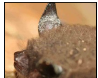
Fungal growth on ear.