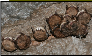
Little brown bats: single bat in center has white-nose syndrome.