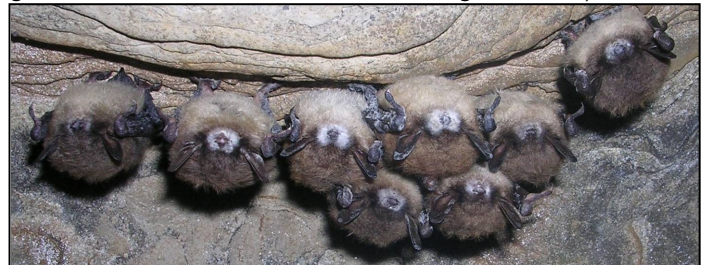
Little brown bats with White-Nose Syndrome, New York.

Transmission is not well understood at this point in time; while bat-to-bat contact seems to be the main mode of transmission, some evidence suggests human transmission is possible (eg. humans going from infected caves to uninfected areas, carrying spores on their clothing and boots).