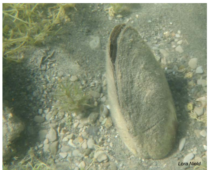
Figure 10. Anodonta typical positioning on a lakebed, in contrast to its typical positioning in soft substrate as shown in Figures 5, 6 and 7.