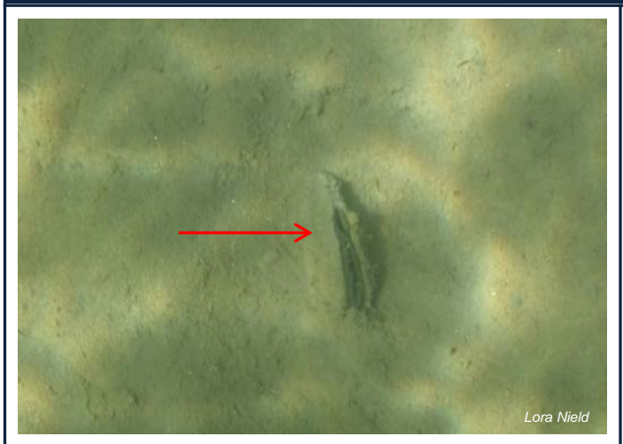
Figure 5. Gonidea angulata partially protruding out of soft substrate. Soft substrates are the easiest to survey, but not all mussels protrude from the substrate as much as this (see Figures 6 and 7).