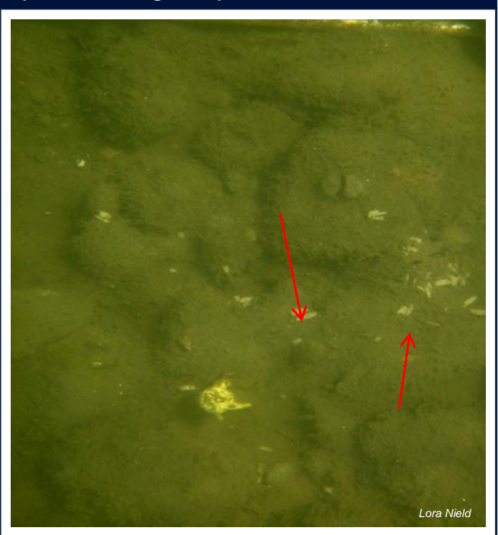
Figure 3. Conglutinates from Gonidea angulata . The white, rice-shaped objects in the photo are conglutinates (packages of glochidia), found in Okanagan Lake. This is another indicator of mussel presence.