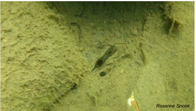
Figures 6 (top) and 7. Gonidea angulata in soft substrate and only showing a siphon. Subsurface mussels can be extremely challenging to detect. In these cases, it appeared as a black line 1-2 cm long looking very similar to many small sticks on the lakebed. In high-risk activities, excavation may be required (see Guidance for Freshwater Mussel Detection and Relocation in the Okanagan

http://www.env.gov.bc.ca/okanagan/esd/bmp.html).