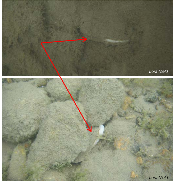
Figures 8 (top) and 9. Gonidea angulata with foot exposed. In these photos, the mussels are laying on the lakebed and resemble rocks. However, in this case the foot is partially exposed at the shell opening. The white colour of the foot indicates that a live mussel is present.

http://www.env.gov.bc.ca/okanagan/esd/bmp.html).