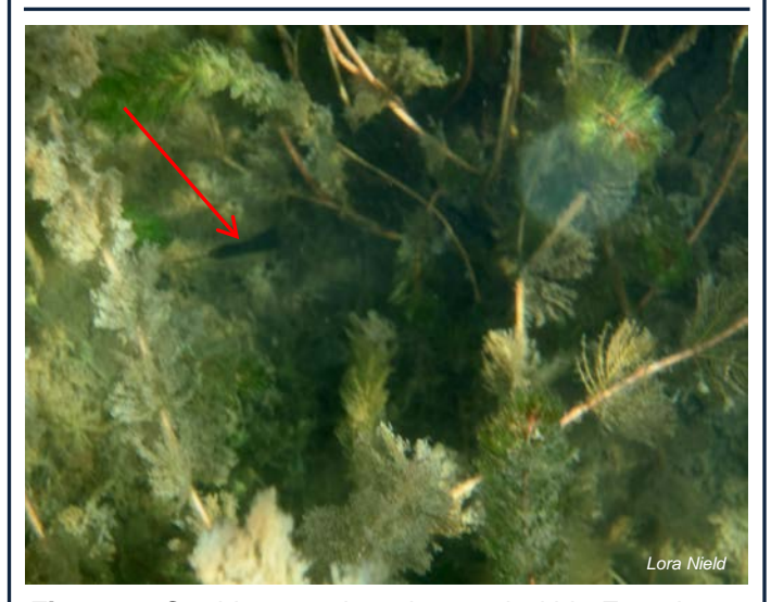
Figure 2. Gonidea angulata observed within Eurasian milfoil bed in Okanagan Lake. Vegetated areas are difficult to survey but should not be excluded from surveys. This mussel is almost completely subsurface with the exception of the exposed siphon.