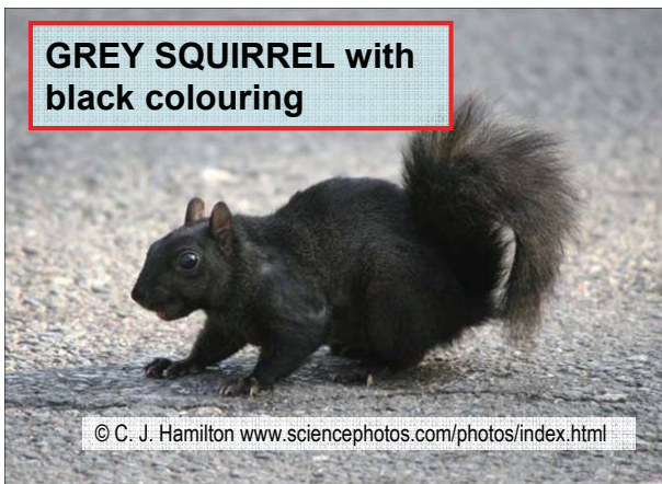
GREY SQUIRREL with black colouring