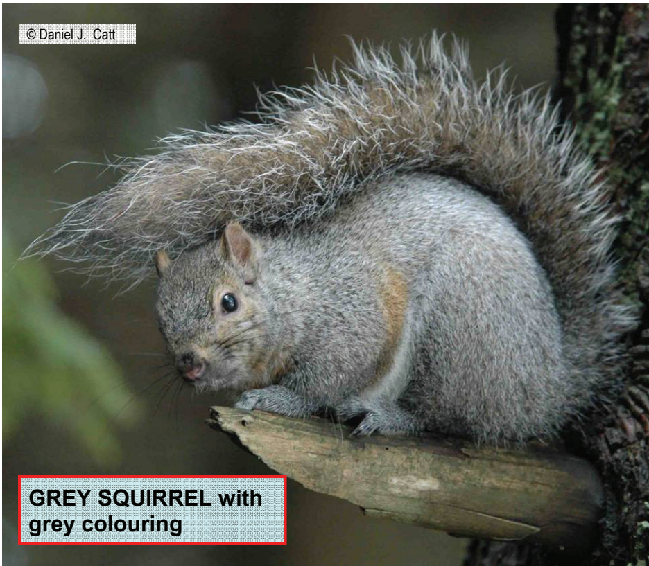
GREY SQUIRREL with grey colouring

Have you seen this squirrel in your area?